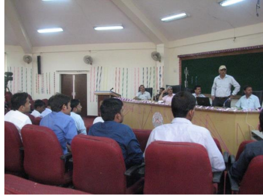
Interaction between officials from ITC-Technico Agri Sciences and students