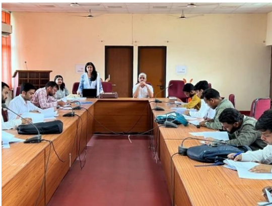
ITC-Technico Agri Science conducting written test for preliminary screening