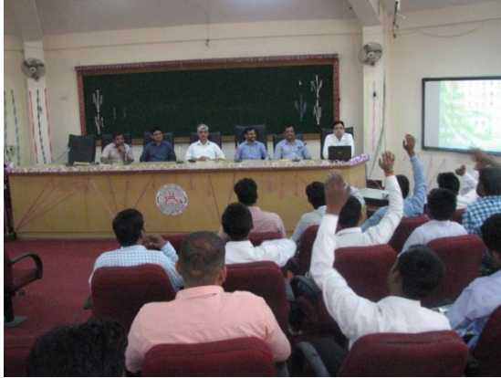
Interaction between officials from Dayal Fertilizer Group and students