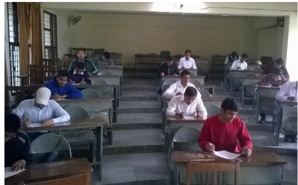
Written test for hiring cane supervisor at different UP Government's Sugar mills