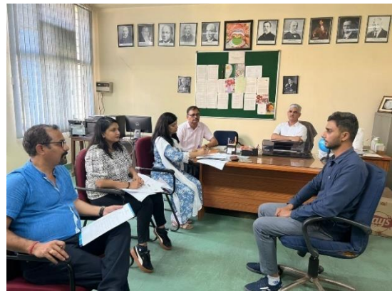
ITC-Technico Agri Science conducting interview for the post of Agronomist