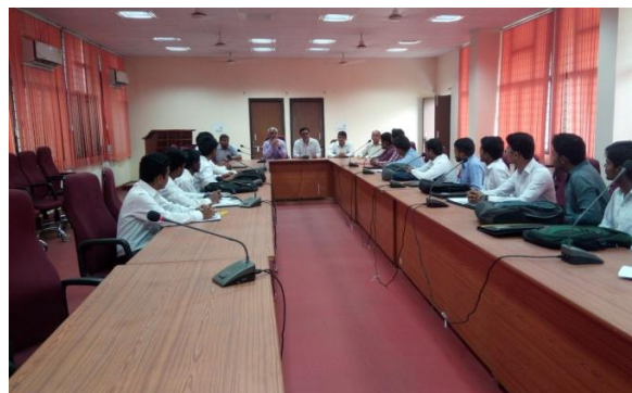
Members of recruitment team from Saraswati sugar mills Limited, Yamuna Nagar interacting with aspirants before interview