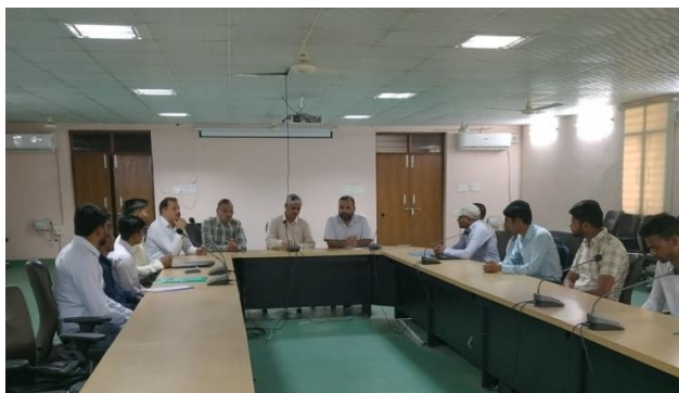
Members of recruitment team from Royal Crop Science interacting with aspirants before interview

The team of Directorate of Training and Placement discuss collectively regularly and contact with different private sector companies through email and telephone to conduct recruitment drives at campus. Directorate of Training and Placement circulate the placement notice on the notice board of Colleges and Hostels along with putting same on the University website and Telegram Channel for inviting applications. Placement notice gives details regarding company profile, name of position, salary package essential qualifications etc. After collection of resumes from interested candidates Directorate in consultation with hiring company organize the campus interview.