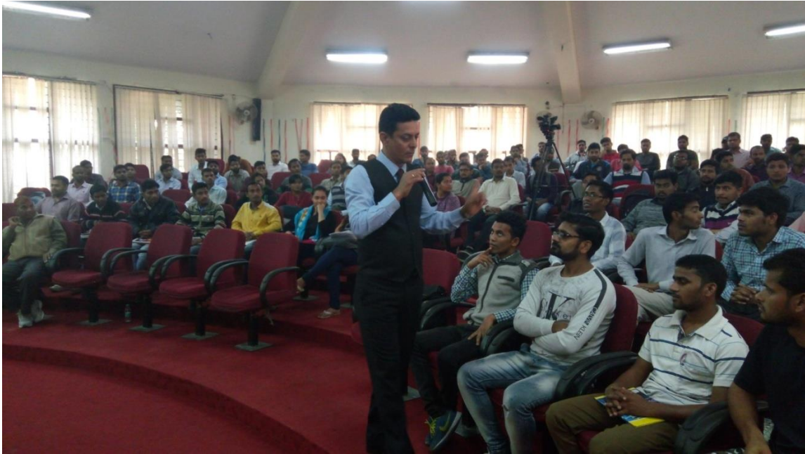
ITTeam member from 'MS AenApex Edu Services, Noida' interacting with students during "Soft skill training & personality development programme" organized on 21 – 22 February 2018.

sectors. Some professional carrier guidance companies are also invited for carrier guidance. Orientation program for carrier/job opportunities are also organized by Directorate at the beginning of academic session for freshers' students of all degree program.